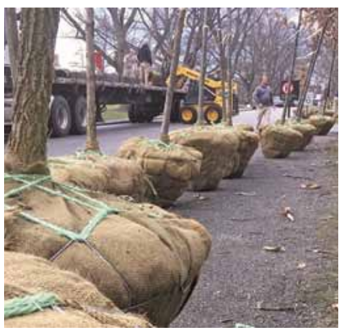
While change can be difficult, it is nice to have a hand in something that the next generation will see and value.