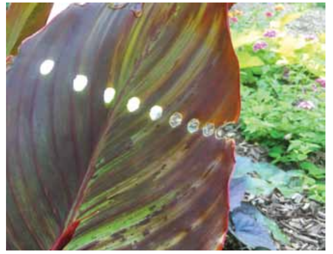
Sometimes a big lunch leaves a toll, like on this Canna.