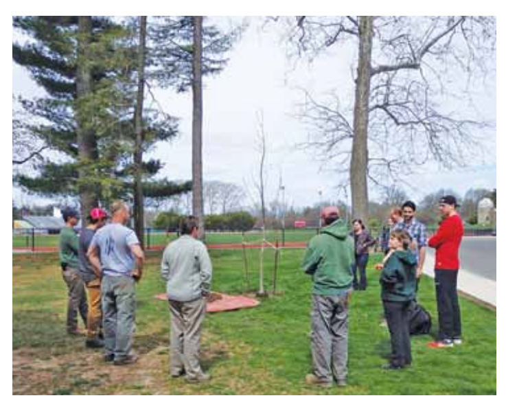
Students, staff and visitors from the community helped plant a tree each day of Earth Week.

Thanks to the Arboretum staff, the Haverfarm, the Committee for Environmental Responsibility, QHouse, Effective Altruism for Animals, and all other contributors for their help planning a wonderful week. May we continue to be mindful of our relationships to our environments in every moment of every day!