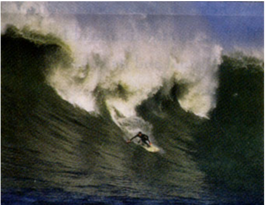
A prize contender

Two applications of vibrations and waves are shown here--surfing a monster wave, and string theory, the potential theory of everything. It is not an exaggeration to say that a thorough understanding of oscillators, coupled oscillators, and waves is central to virtually every area of