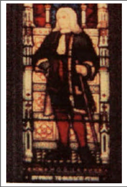
Robert Hooke (1635-1703)