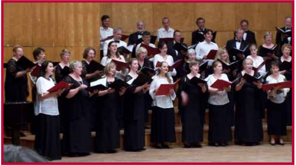
Bucks County Choral Society combined choirs in Timisoara, Romania

So how to go about choosing choirs with whom to seek collaboration? There are usually a number of overlapping considerations. To make sure the musical part of the collaboration can work, it is good to seek out cultures with a vibrant indigenous choral tradition where choirs of your peers (students or community members) are active and available at the time of year you can travel. This will tend to rule out summertime travel to countries in the northern hemisphere, but there are many countries below the equator in South America, South Africa, and Asia that are ripe for choral collaborations when our summer is their winter.