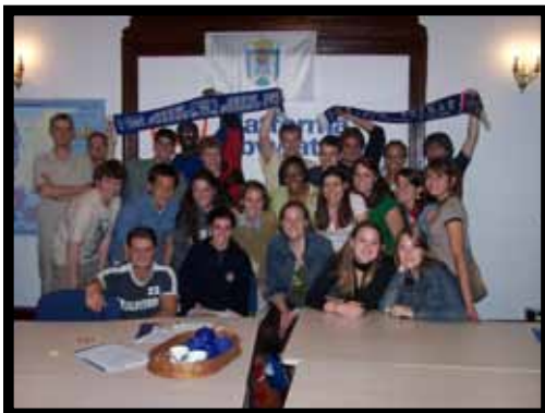
Pre-concert meeting with Young Democrats 3, Poland

In an academic choral program, choosing a region to visit where a faculty colleague has research interest or familial roots can make student preparation for the exchange much richer. This can be especially fruitful in colleges that are small enough to enable collaborative teaching in preparation for a tour. My last three college tours have involved other faculty in teaching, helping to make local arrangements, and going along on the trip itself as a co-leaders and teachers. In addition, these faculty have brought along non-singing students with special academic interest in the culture being visited. These students have loved being part of the experience, and become the perfect advocates back home for what makes collaborative choir tours special.