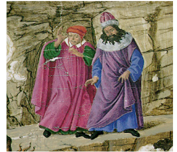
Botticelli (1445-1510), Dante and Vergil

Vergil, the preeminent Latin poet, was born Publius Vergilius Maro on October 15, 70 BCE, near Mantua, a city in northern Italy. The son of a farmer, Vergil studied in Cremona, then in Milan, and finally in Rome. Around 41 BCE, he returned to Mantua to begin work on his Eclogues , which he published in the early 30s BCE. Soon afterward, civil war forced him to flee south to Naples, where seven years later he finished his second work, the Georgics , a long poem on farming. At this time, Vergil's writing gained him the recognition of the public, support from patrons, and the favor of the emperor.